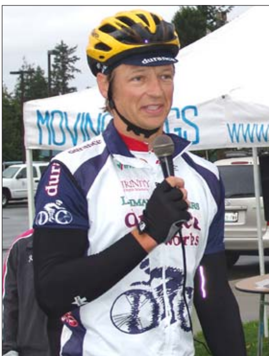
Former NBA and University of Washington basketball star Detlef Schrempf brought "star power" as a rider in the 2004 MS 150.